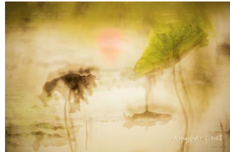
Color - Whispering

multiple exposure photographic techniques, recreating the visual aesthetic of "freehand style" painting, depicting the "poetic world".