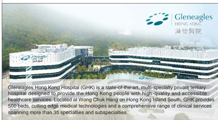
Gleneagles Hong Kong Hospital (GHK) is a state-of-the-art, multi-specialty private tertiary hospital designed to provide the Hong Kong people with high-quality and accessible healthcare services. Located at Wong Chuk Hang on Hong Kong Island South, GHK provides 500 beds, cutting edge medical technologies and a comprehensive range of clinical services spanning more than 35 specialties and subspecialties.

HKMAPS Library was established at the HKMA Secretariat (5/F., Duke of Windsor Social Service Building, 15 Hennessy Road, Wanchai). You are most welcome to donate your photo albums/collections to the Library for sharing purpose. You are also encouraged to come and read our collections inside the Library.