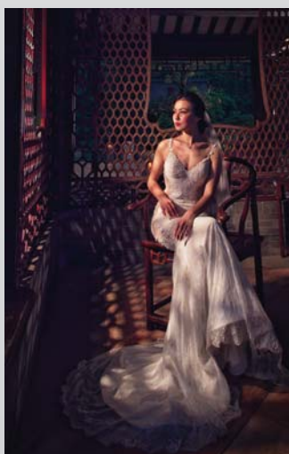
2 nd Runner-up:

何寶甜師傅：作者時機掌握得好，帆船不但沒有遮擋對岸的中銀大廈，更把它安放於兩張帆中間，拍攝角度、位置及燈光都捕捉得非常好。