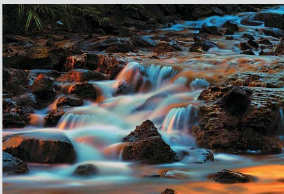
1st Runner-up and Best of Landscape:

張淑歡師傅：這照片的佈局和比例處理得很好，構成了一個三角形佈局，鳥兒的姿態十分優美，水花亦捕捉得不錯。